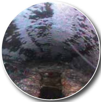
View of FOG build-up inside sewer pipe